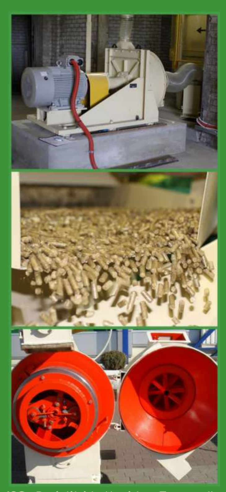
JSC "Radviliskis Machine Factory"

Vytauto str. 3, Radviliskis, Lithuania Sales Office: Daukanto str. 11A, Kaunas Lithuania